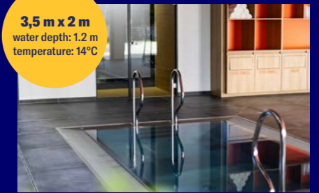
3,5 m x 2 m water depth: 1.2 m temperature: 14°C