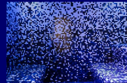
FINNISH SAUNA, INFRARED SAUNA AND STEAM SAUNA