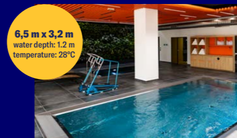
6,5 m x 3,2 m water depth: 1.2 m temperature: 28°C